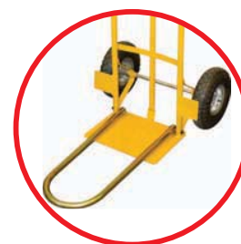
"BIGFOOT" ATTACHMENT (PHR111) COMES STANDARD ON PHR106, PHR107 & PHR108 MODELS