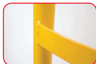
HIGH QUALITY WELDS