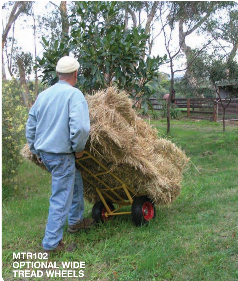
MTR102 OPTIONAL WIDE TREAD WHEELS