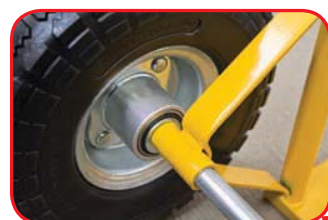
PNEUMATIC WHEEL WITH PRECISION BEARINGS